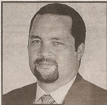
NAACP President Benjamin Jealous